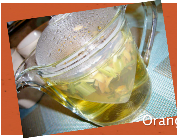
Orange Herb Tea